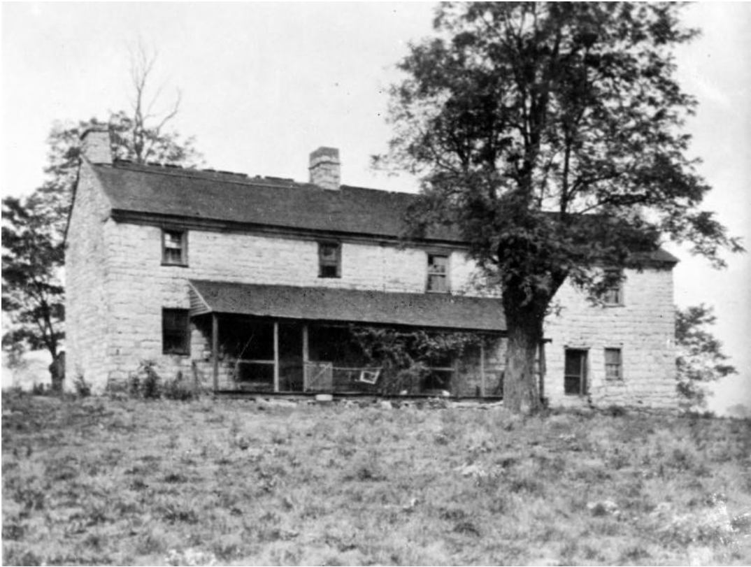
The Old Stone House in 1910 from the southeast. The original portion is on the left. (National Register of Historic Places Inventory, Nomination Form, Harlan's Station Site and James Harlan Stone House Ruin, 21 Oct 1976.)