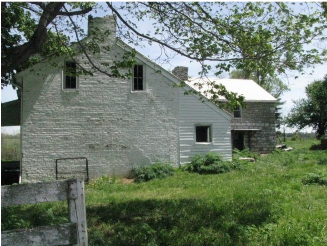
Elijah Harlan House with stone slave quarters on right (Photo by the author, April, 2012)