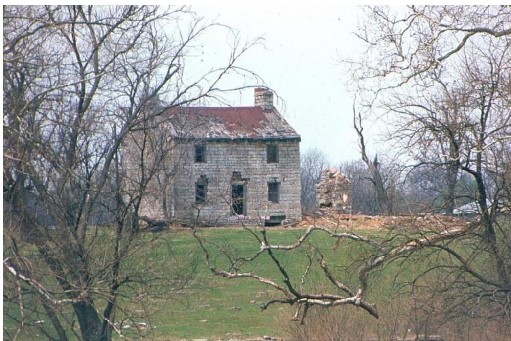
The Old Stone House, 1967. What remains is the original portion, the entire north section having collapsed.