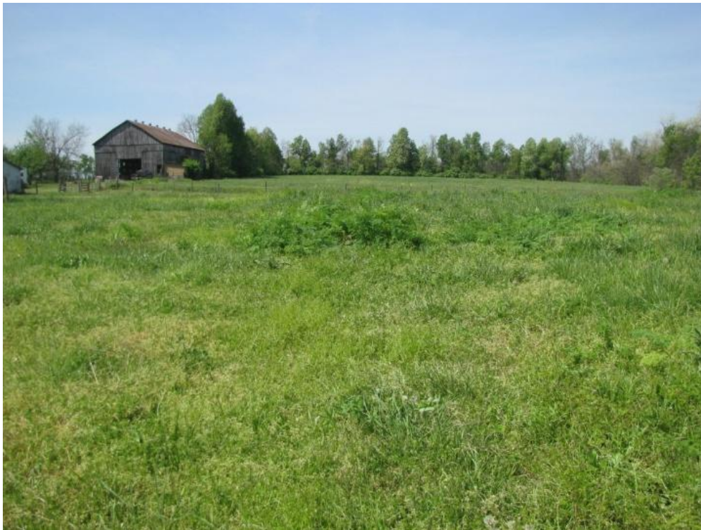
Site of "The Old Stone House", looking west