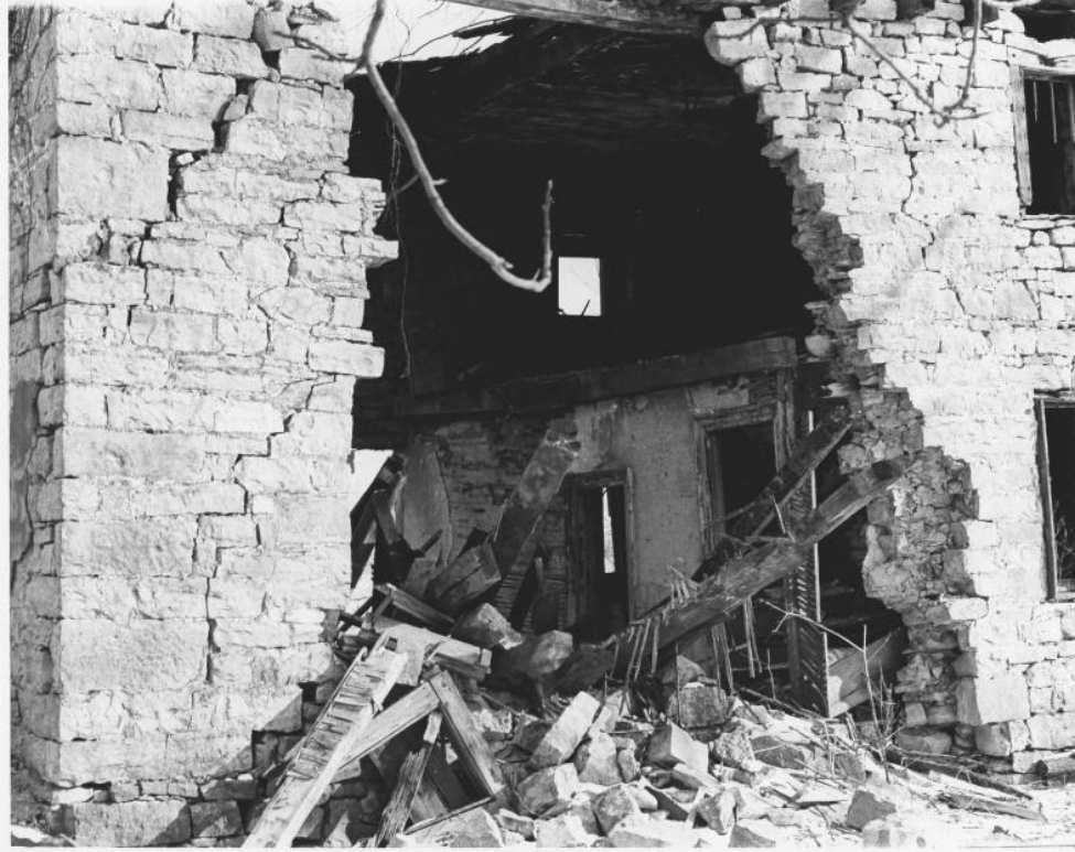
The Old Stone House, 1976, from the northeast showing the interior portion which divides the hall and parlors. The door on the left enters the southeast parlor and the door on the right goes to the enclosed stairs. (National Register of Historic Places Inventory, Nomination Form, Harlan's Station Site and James Harlan Stone House Ruin, 21 Oct 1976.)