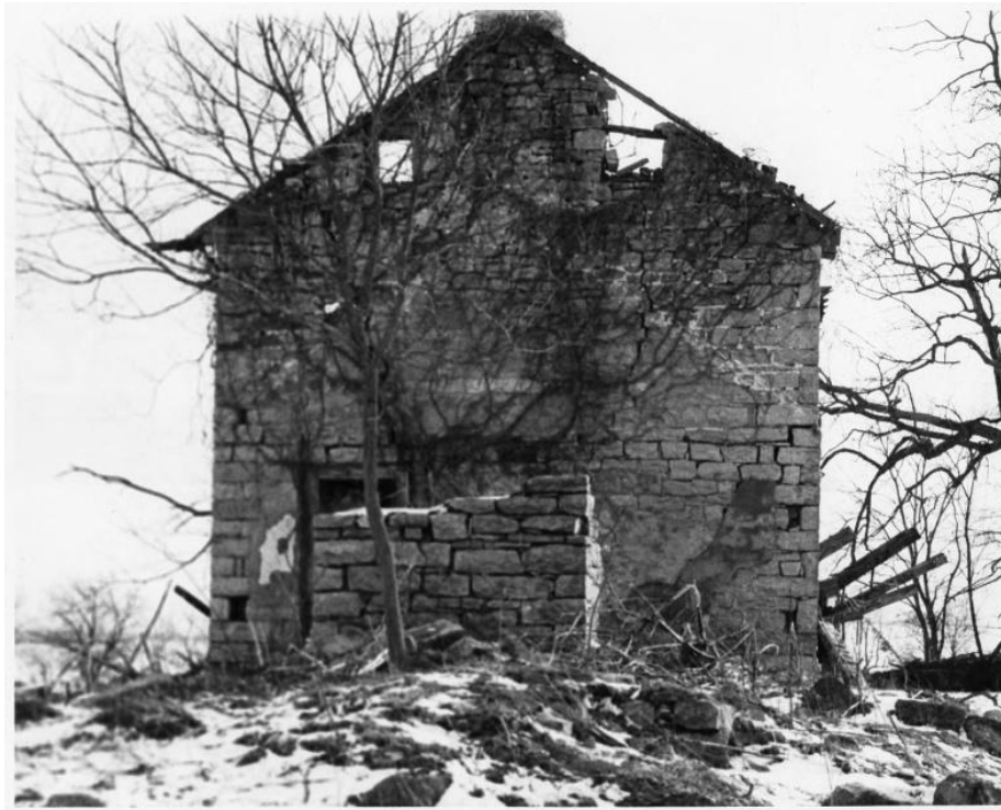
The Old Stone House, 1976, showing remnants of the chimney base of the north addition. (National Register of Historic Places Inventory, Nomination Form, Harlan's Station Site and James Harlan Stone House Ruin, 21 Oct 1976.)