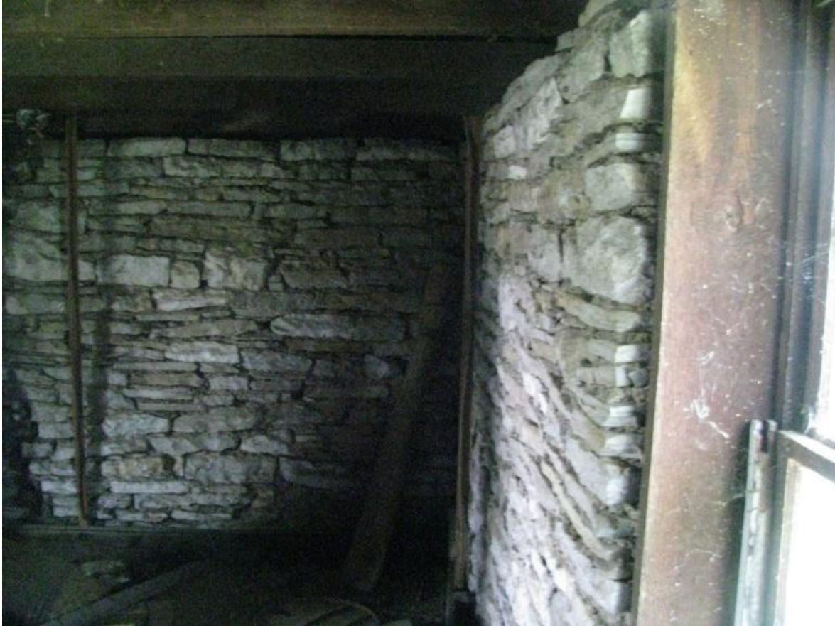
Elijah Harlan House, Slave Quarters upstairs (Photo by the author, April, 2012)