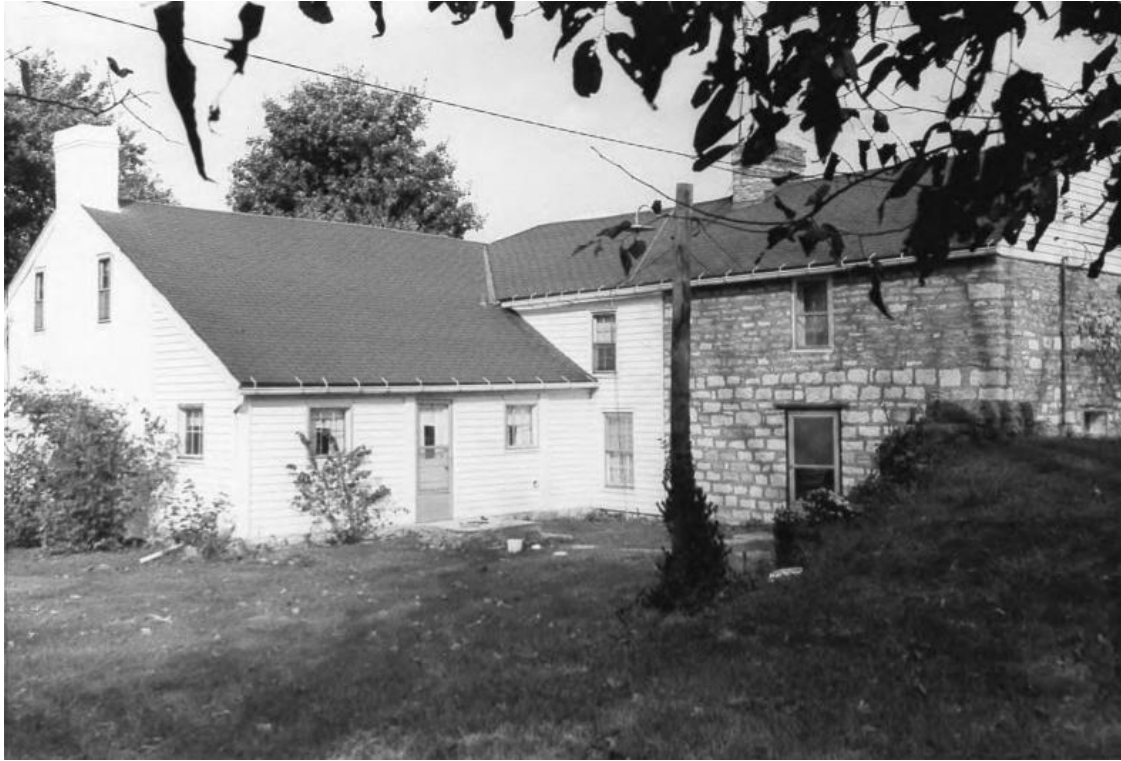
Elijah Harlan House, 1982, west side, south rear and root cellar. ("Elijah Harlan house, Site No BO 292." Kentucky Historic Resources Inventory . 1982.)