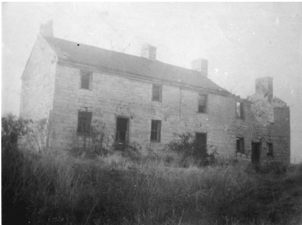
The Old Stone House, 1954, east elevation; there was an ell behind the fallen north end extending to the west. (National Register of Historic Places Inventory, Nomination Form, Harlan's Station Site and James Harlan Stone House Ruin, 21 Oct 1976.)