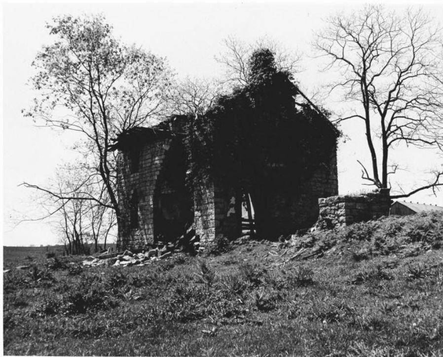
The Old Stone House, 1976, from the northeast showing the original portion and the base of the addition to the right. (National Register of Historic Places Inventory, Nomination Form, Harlan's Station Site and James Harlan Stone House Ruin, 21 Oct 1976.)