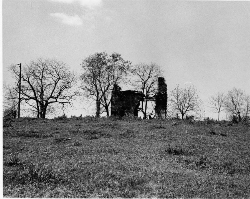
The Old Stone House, 1976, original section on the south, after being destroyed by the tornado of April 1974. (National Register of Historic Places Inventory, Nomination Form, Harlan's Station Site and James Harlan Stone House Ruin, 21 Oct 1976.)