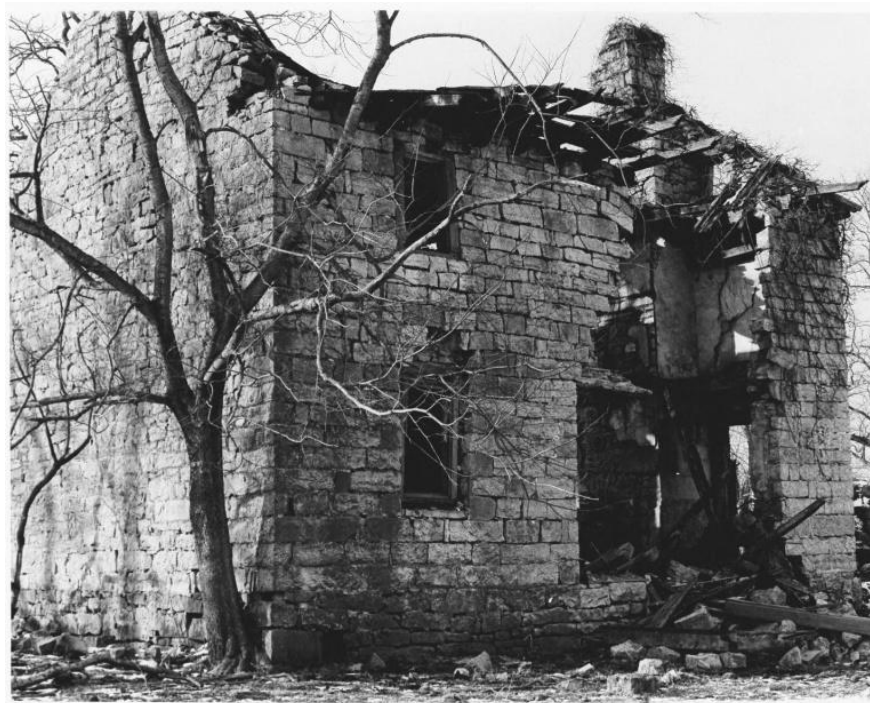
The Old Stone House, 1976, from the southeast showing the parlors on the left. (National Register of Historic Places Inventory, Nomination Form, Harlan's Station Site and James Harlan Stone House Ruin, 21 Oct 1976.)