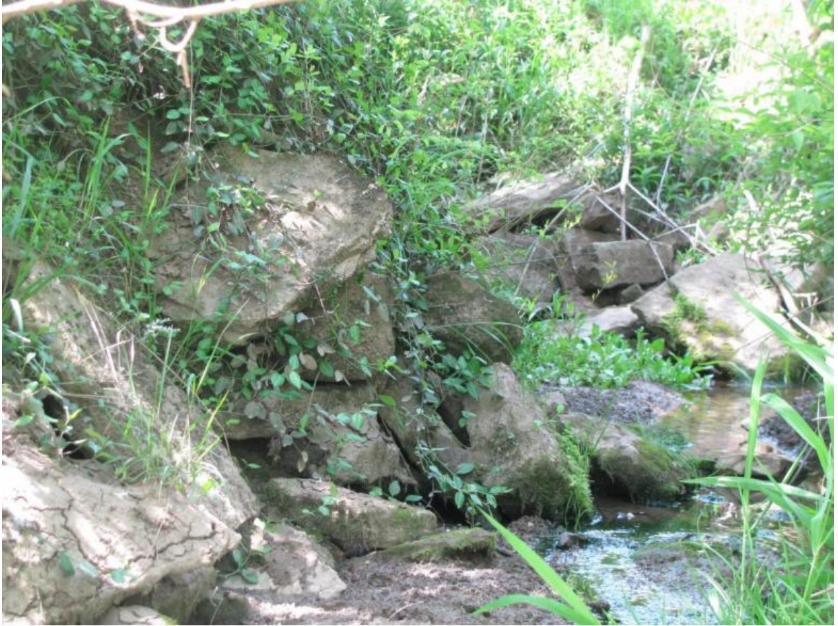
Remnants of the Spring House at the "Old Stone House"