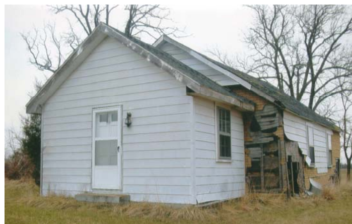
Meaux Chapel AME Church: African Methodist Episcopal Church established before 1870 in Mayo.