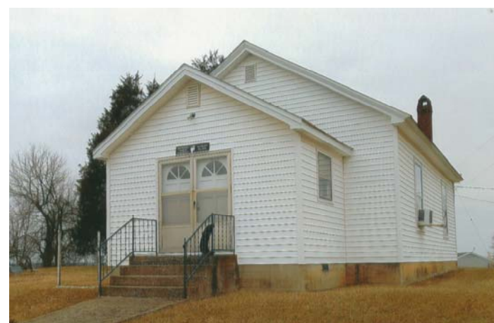
Dividing Ridge Baptist Church: Established circa 1870.