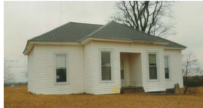
Mayo Colored School: Closed at the end of the 1951-1952 school term. Students were transferred to West Side School in Harrodsburg.