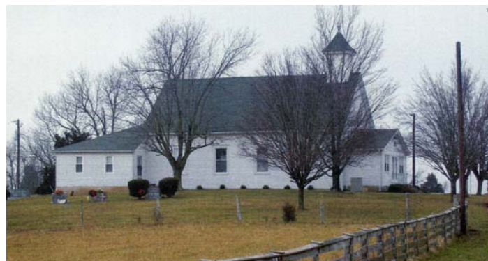
Mayo Christian Church and Cemetery