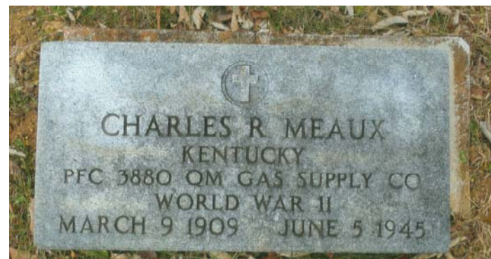
Cemetery: Adjoins Dividing Ridge Baptist Church. Includes African American interments for Dividing Ridge Baptist Church & Meaux Chapel AME Church.